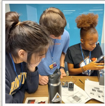
Space Day STEM Activity