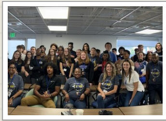
Space Day Group Photo

Thanks to the generosity of Lockheed Martin, students from Cocoa High School and Palm Bay Magnet High School were able to participate in "Space Day, 2023" on October 5th. Students engaged in a series of hands-on demonstrations, engineering challenges, and had the opportunity to "Run on Mars," using Lockheed Martin's virtual reality technology. These students also were given information on internships, apprenticeships, scholarships and job opportunities within the company as they leave High School. A big thank you to Lockheed Martin for their continued support of Brevard Public School students!